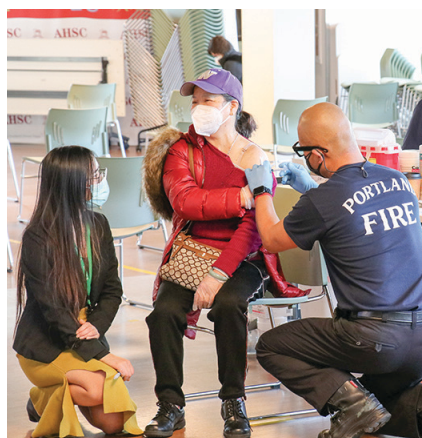
Portland Fire personnel assisted with AHSC's vaccine clinics.

The arrival of COVID-19 vaccinations has created hope as well as confusion over how, when and where to access a vaccine. For those experiencing language and/or cultural barriers, finding timely and accurate information about this process is very challenging. At this critical stage of the pandemic, AHSC's top priority is helping the region's Asian population equitably access COVID-19 vaccinations.