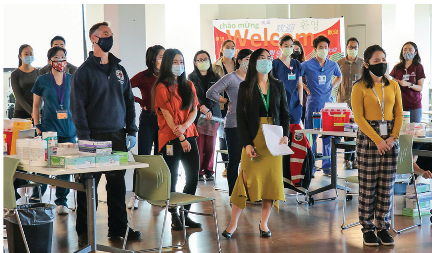
Volunteers and staff listen to a briefing on procedures before AHSC's February 27th vaccination clinic.