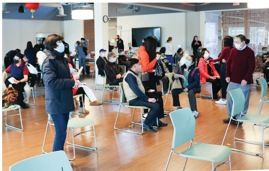
Over 1,400 community members have received COVID-19 vaccinations at AHSC's four clinics.

The arrival of COVID-19 vaccinations has created hope as well as confusion over how, when and where to access a vaccine. For those experiencing language and/or cultural barriers, finding timely and accurate information about this process is very challenging. At this critical stage of the pandemic, AHSC's top priority is helping the region's Asian population equitably access COVID-19 vaccinations.